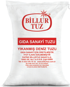
Washed Salt B1 (0,5mm-1,2mm)