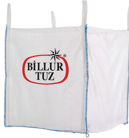
Washed Salt B2 (1mm-2mm)